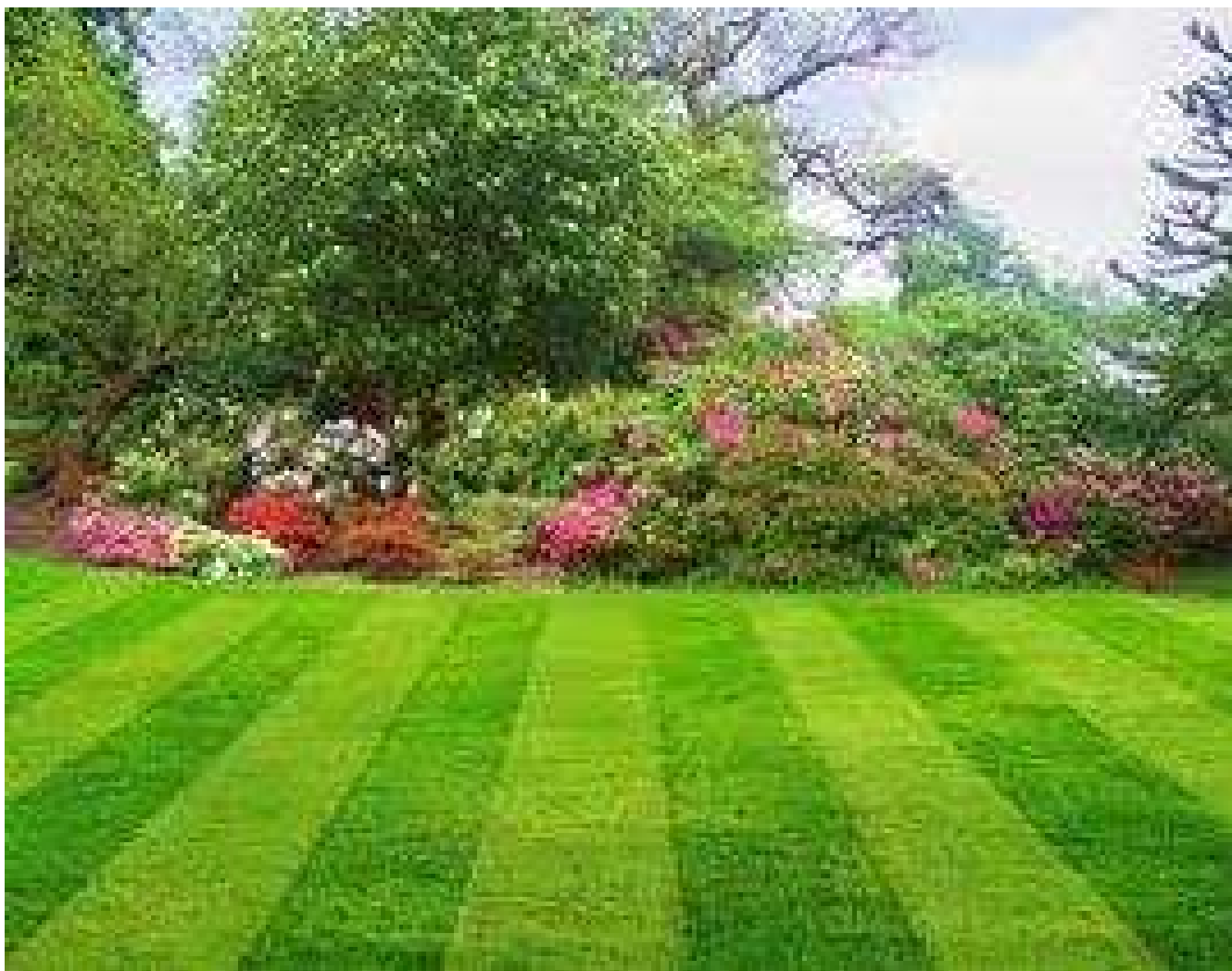
A beautiful garden.