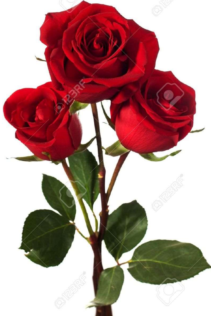
A bunch of roses.